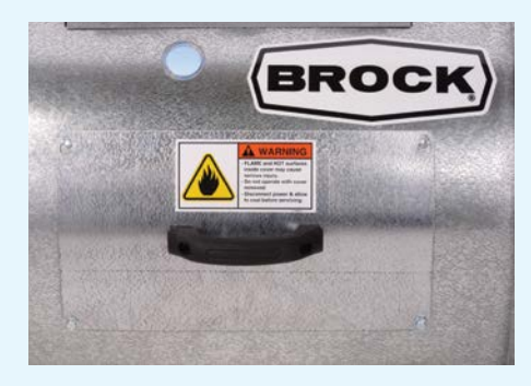
Brock's heaters feature a large service access door. Convenient sight ports on both sides of the heater unit make it easy to do visual checks on the burner unit.