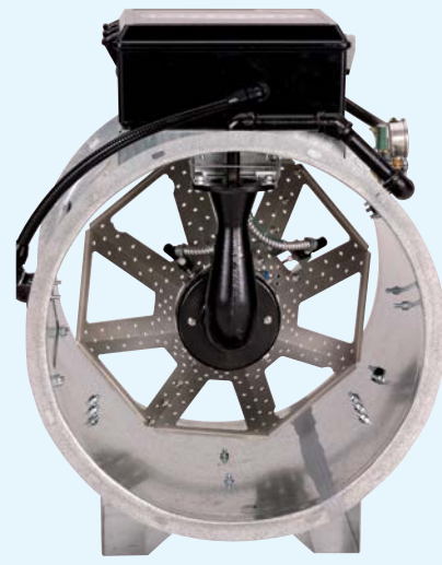
Rodent-resistant conduit protects all exposed wiring, including ignition and flame circuit wires in the burner unit.