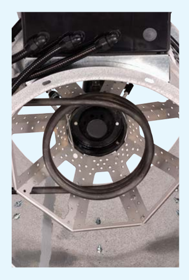
Liquid propane heater models include a high-capacity internal vaporizer . Stainless steel cone is standard.

Heater models are available for use with liquid propane, propane vapor, or natural gas fuels and utilize gas-certified solenoid valves. Brock-supplied regulators are standard on liquid propane models.